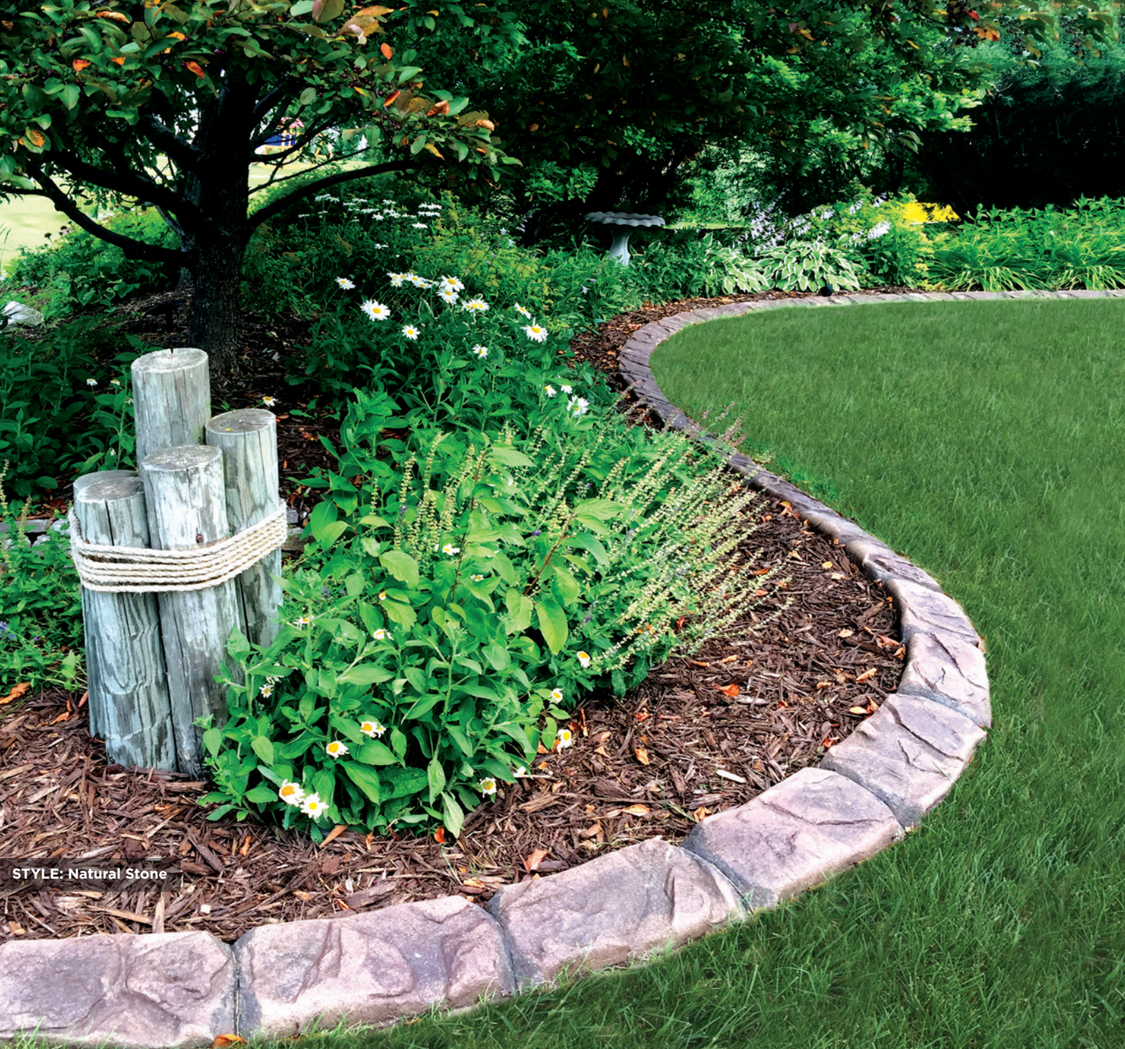
STYLE: Natural Stone