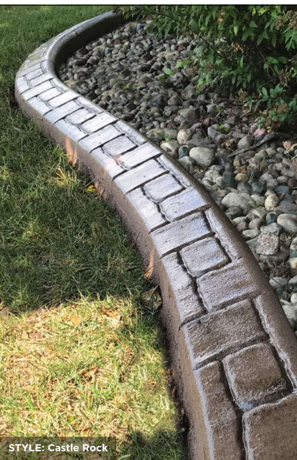
STYLE: Castle Rock