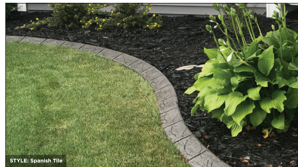
STYLE: Spanish Tile

Your curbing is custom-created on-site. No pre-formed or cast materials are used. We create a solid concrete edging that perfectly follows the contours of your landscaping. Our installation process uses steel cable reinforcing to keep the curbing in perfect alignment through years of seasonal temperature extremes.