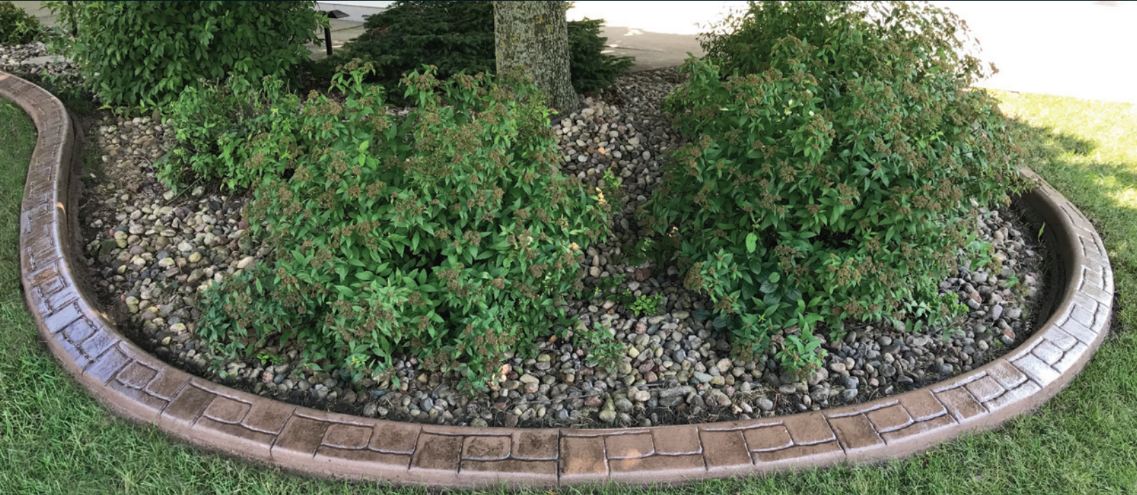
STYLE: Castle Rock