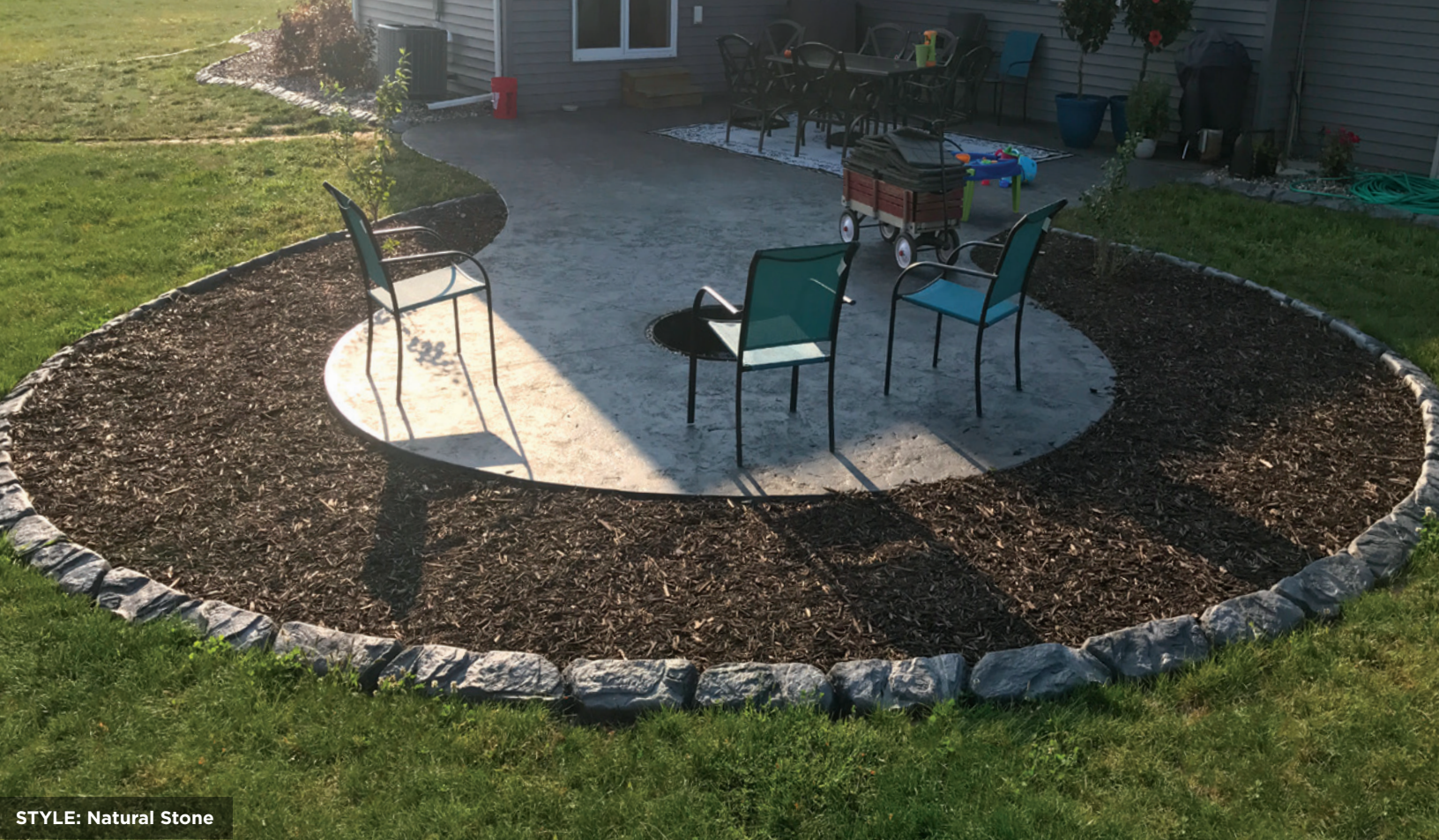
STYLE: Natural Stone